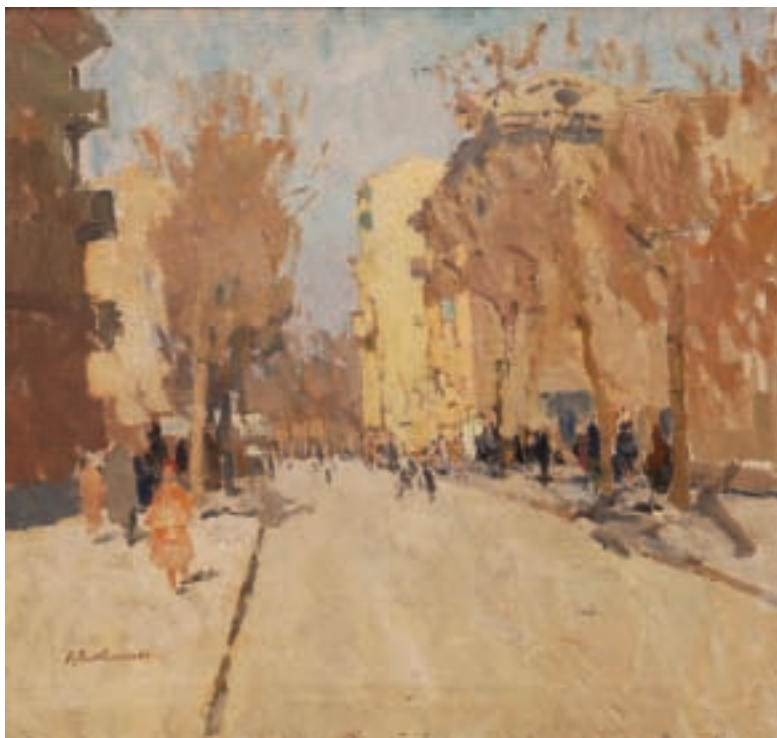
V. LITVINIENKO AUTUMN IN ODESSA 1958 Oil on canvas 71 x 81.5cm