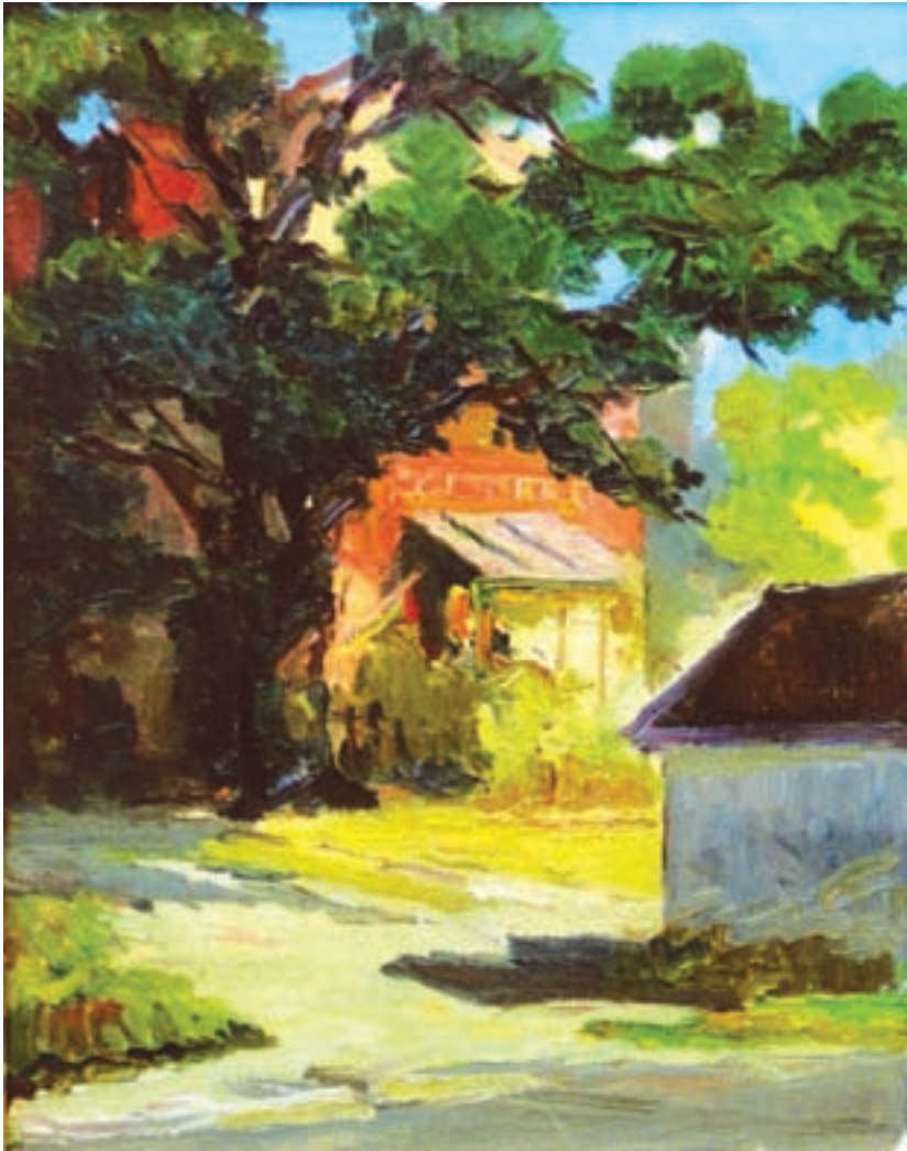
BEZCHASTNOV VILLA NEAR ODESSA 1940s Oil on board 31 x 25cm

Serbutovsky's The Dairymaid (1957) (page 9), Luchenko's The Watermill (opposite) and Popov's Reading to My Brother (1954) (page 8) represent this tendency. The Dairymaid , for instance, is a typical image of the Soviet hero-farmer, a painting celebrating the common worker. Yet it is not the static. Serbotovsky paints with broad, free