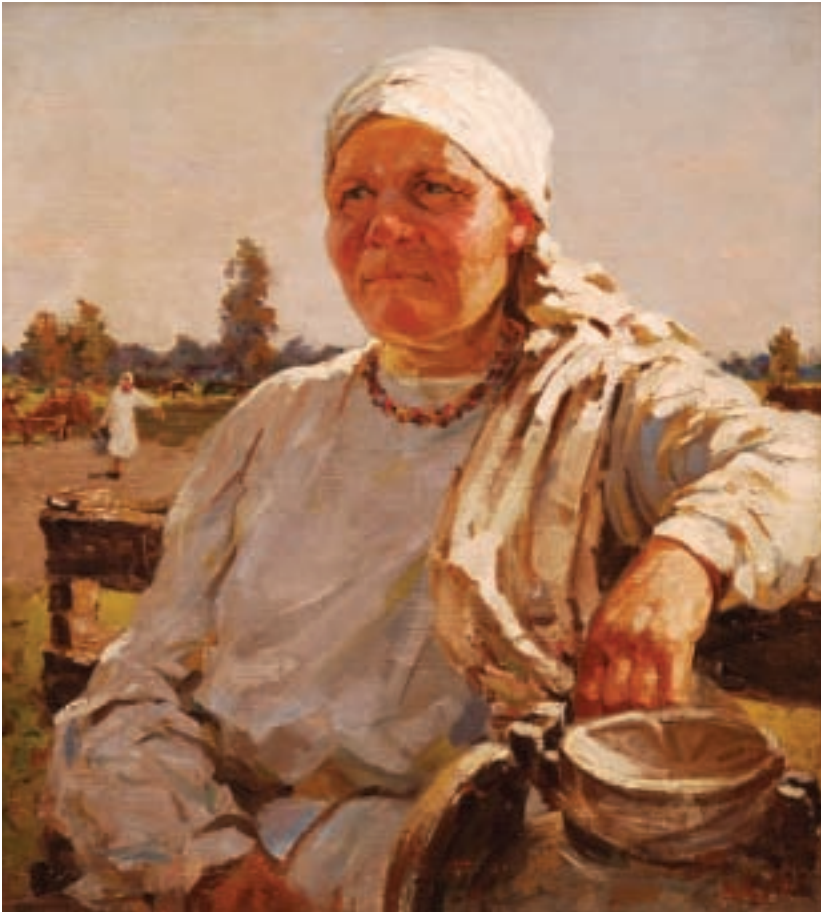
A. A. SERBUTOVSKY THE DAIRYMAID 1957 Oil on canvas 63 x 57cm

sensations, on the transitory effects of light and shadow. By contrast, Soviet artists painted works that were decidedly more vigorous and robust. Their images, in general, are more solid and tangible. Moreover, their art was based on different principles. The term ‘Working Class Impressionism’ is often applied to the Soviet style. These were paintings to capture the hearts of the masses.