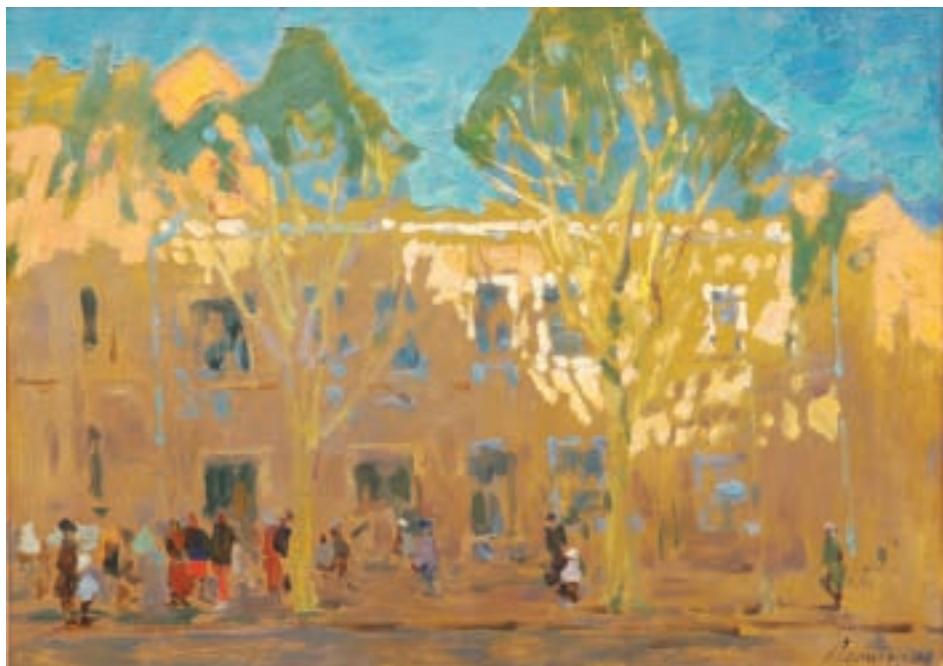
K. LOMYKIN ODESSA STATION HOUSE 1975 Oil on board 50 x 69.5cm