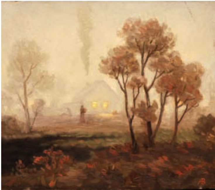
V. ALTANIETZ MORNING MIST 1970s Oil on board 29.5 x 34.5cm