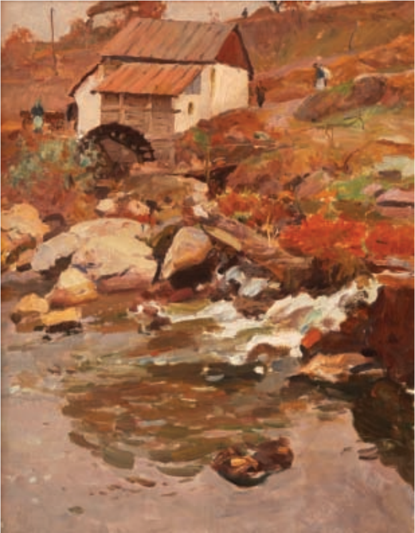
LUCHENKO THE WATERMILL b.1914 Oil on canvas 78 x 62cm

brush strokes and the warm sunshine lends the piece an immediate appeal.