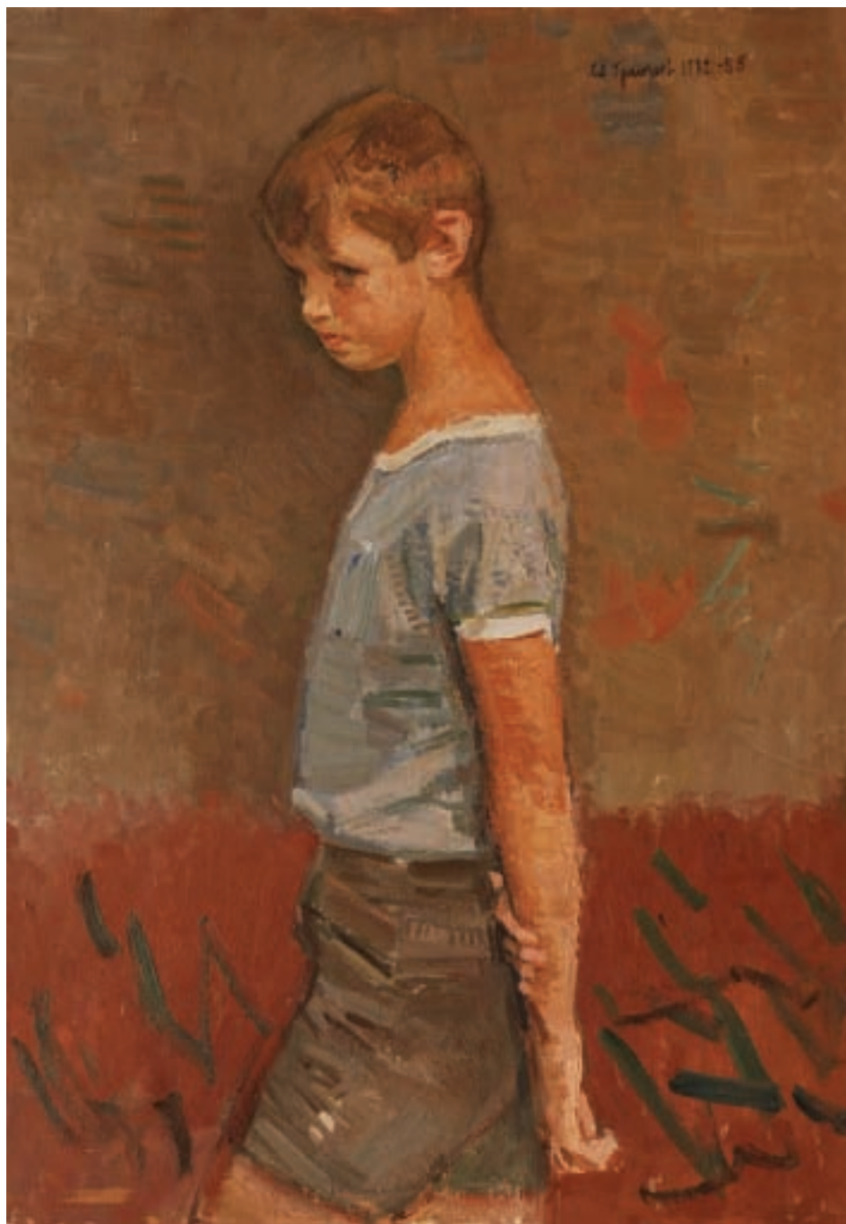
S.A. GRIGORYEV A BOY WITH CHARACTER 1982 Oil on canvas 100 x 70cm