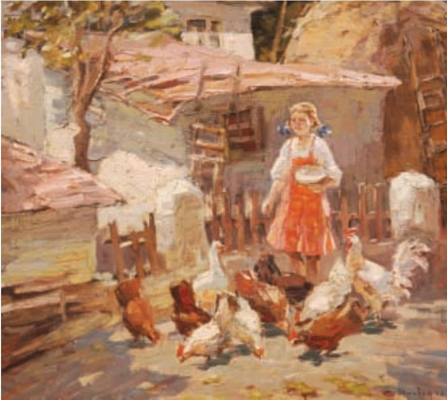
S. YARAVOI FEEDING THE CHICKENS Oil on canvas 71 x 75cm