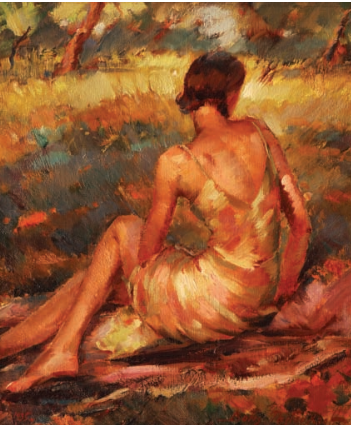
B. PASTUKOV SEATED LADY 1935 Oil on canvas 54 x 45cm