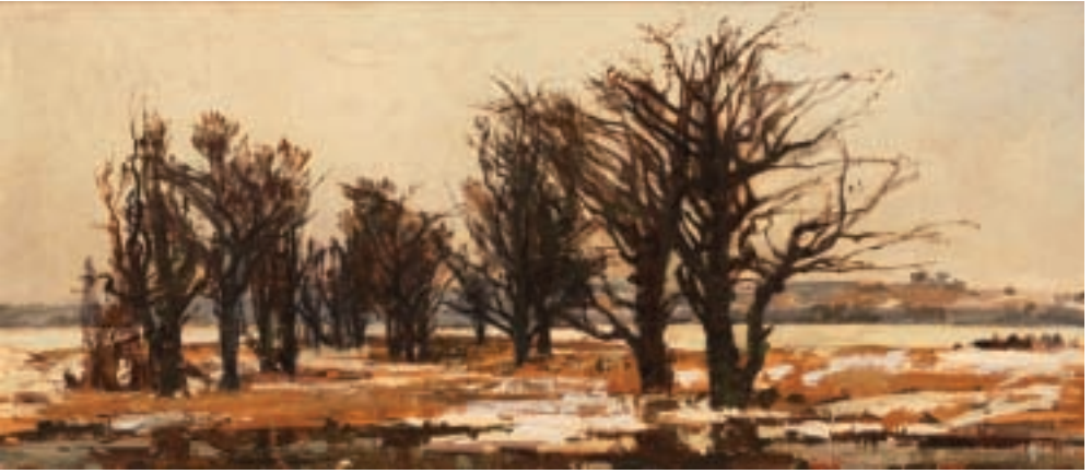
SYSOLATIN SPRING THAW b.1936 Oil on board 52 x 120cm