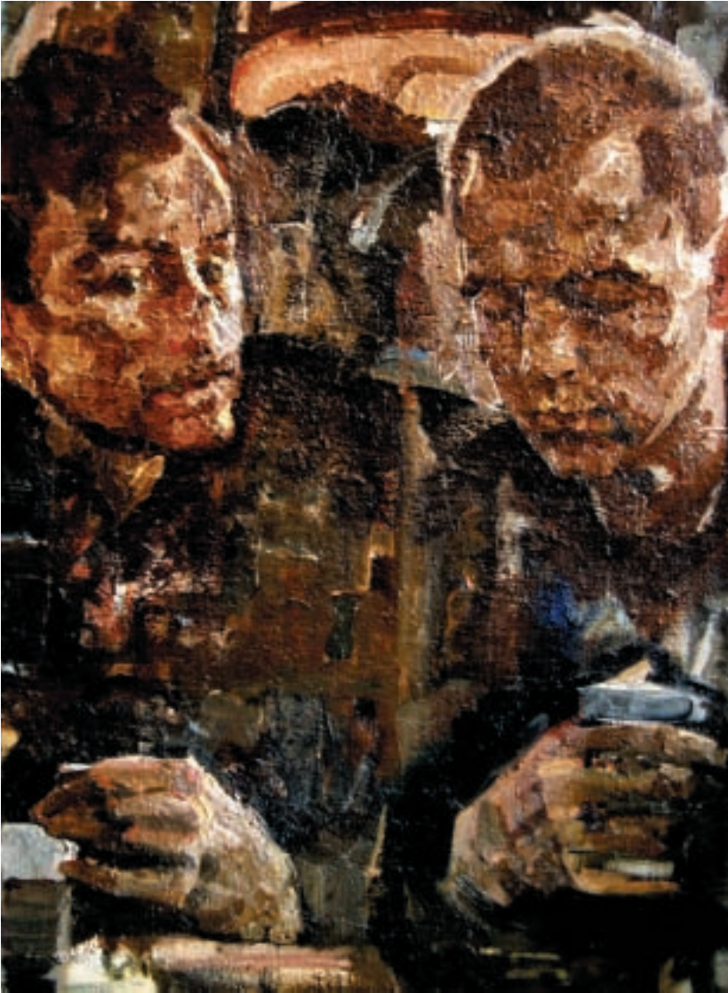
P. VECHKANOV FRIENDS II 2000 Oil on canvas 70 x 50cm

The view that Soviet artists were robots working in a mechanical fashion, producing overtly political paintings in a tediously academic style, is thus confounded. Indeed, it is difficult to make generalisations about the nature of