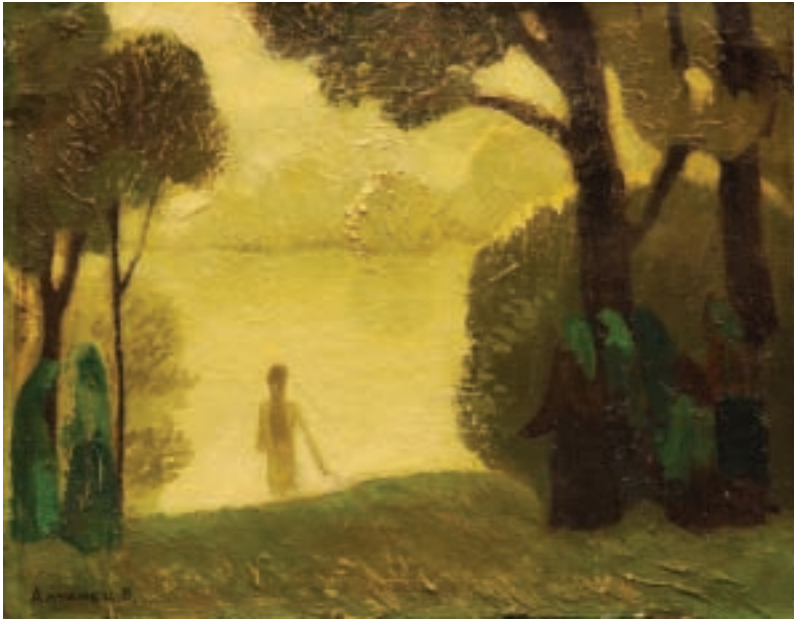
V. ALTANIETZ MORNING 1977 Oil on board 29 x 36cm