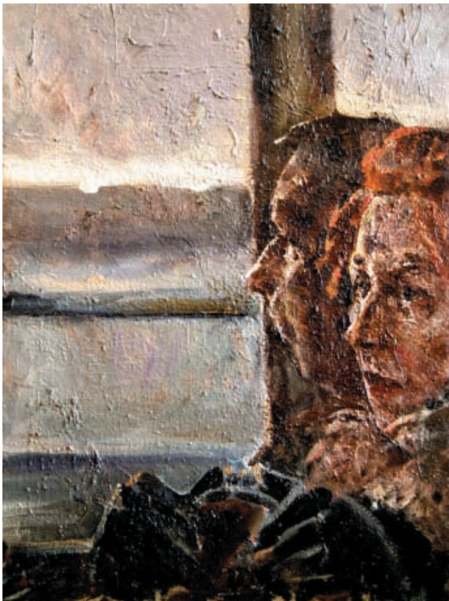
P. VECHKANOV COUPLE 2000 Oil on canvas 67 x 50cm