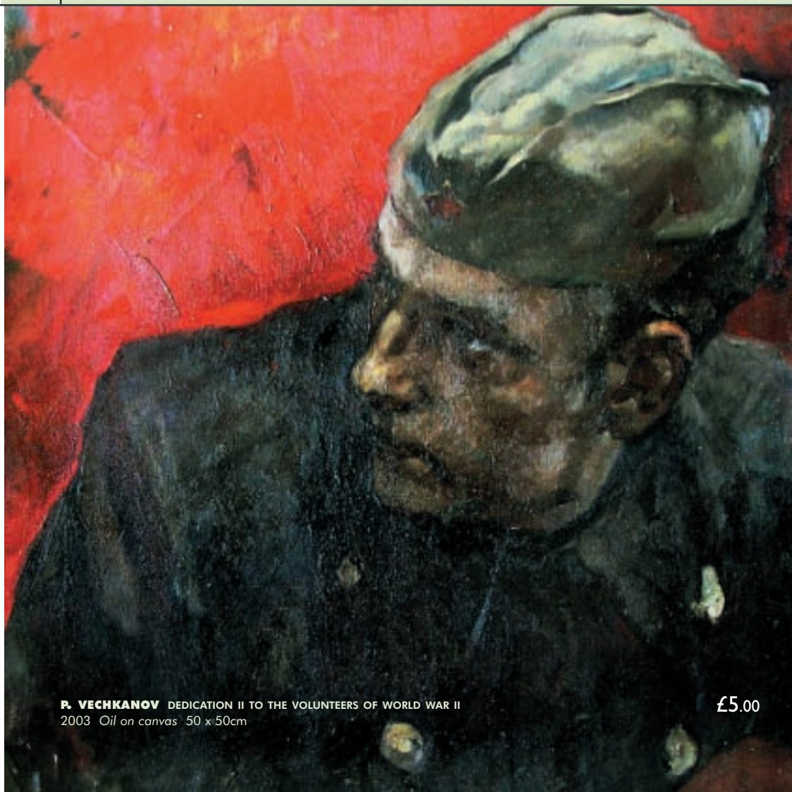
P. VECHKANOV DEDICATION II TO THE VOLUNTEERS OF WORLD WAR II 2003 Oil on canvas 50 x 50cm