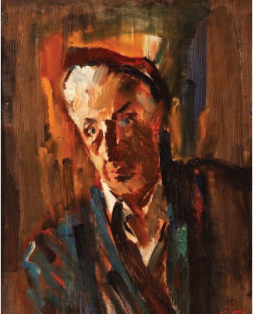
B. PASTUKOV SELF PORTRAIT 1935 Oil on canvas 64 x 49cm

It was in the 1950s, especially after Stalin's death in 1953, that Impressionist influences began to return in full force. Soviet artists gained more freedom to develop their own personal styles. Although the subjects depicted were often in keeping with the Socialist Realist ethos, they were now given a more Impressionistic treatment. Works like