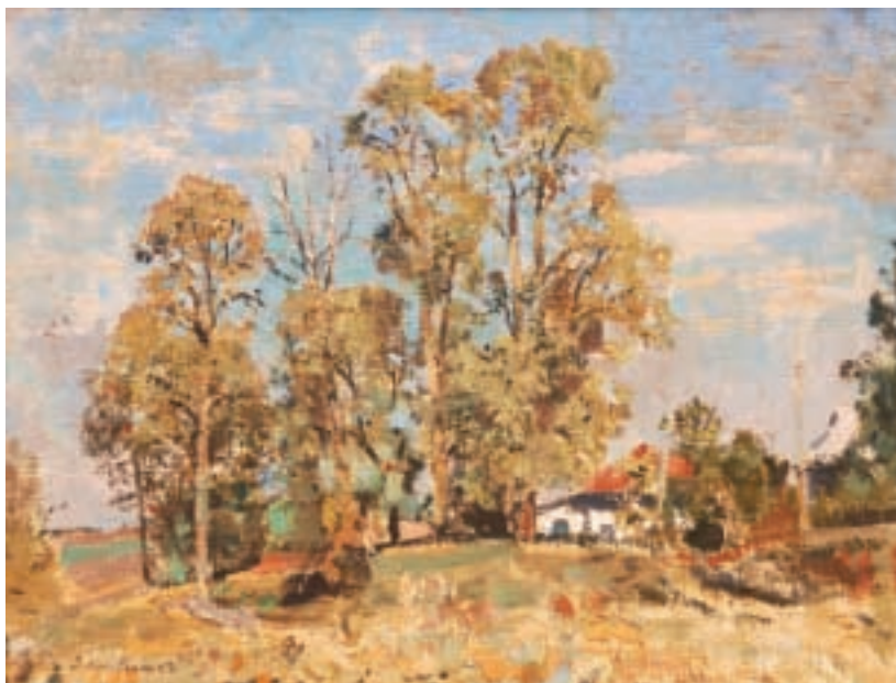
V. LITVINIENKO TEEMCOVE 1988 Oil on canvas 52 x 68cm