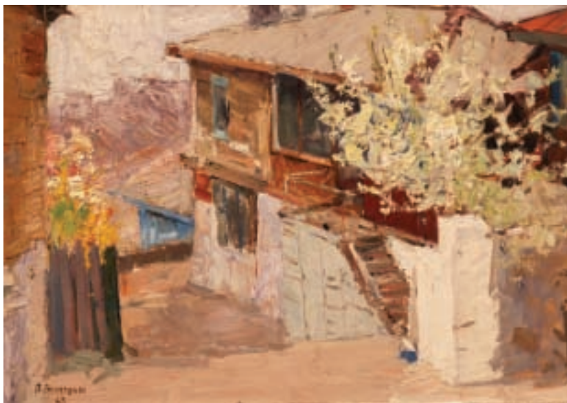
STOLYARENKO YALTA STREET (CRIMEA), BLOSSOMING PLUM TREE 1963 Oil on board 49 x 69cm