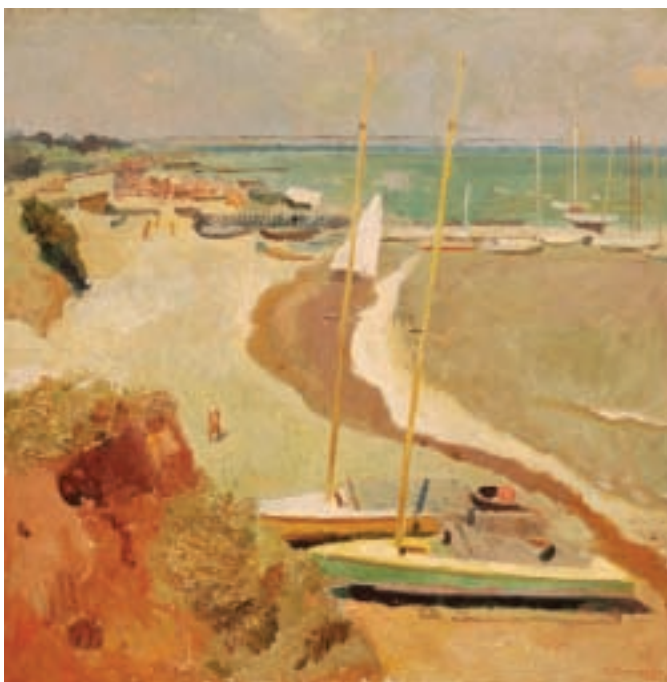
O. VOLOSHINOV SAILING BOATS 1976 Oil on canvas 85 x 85cm