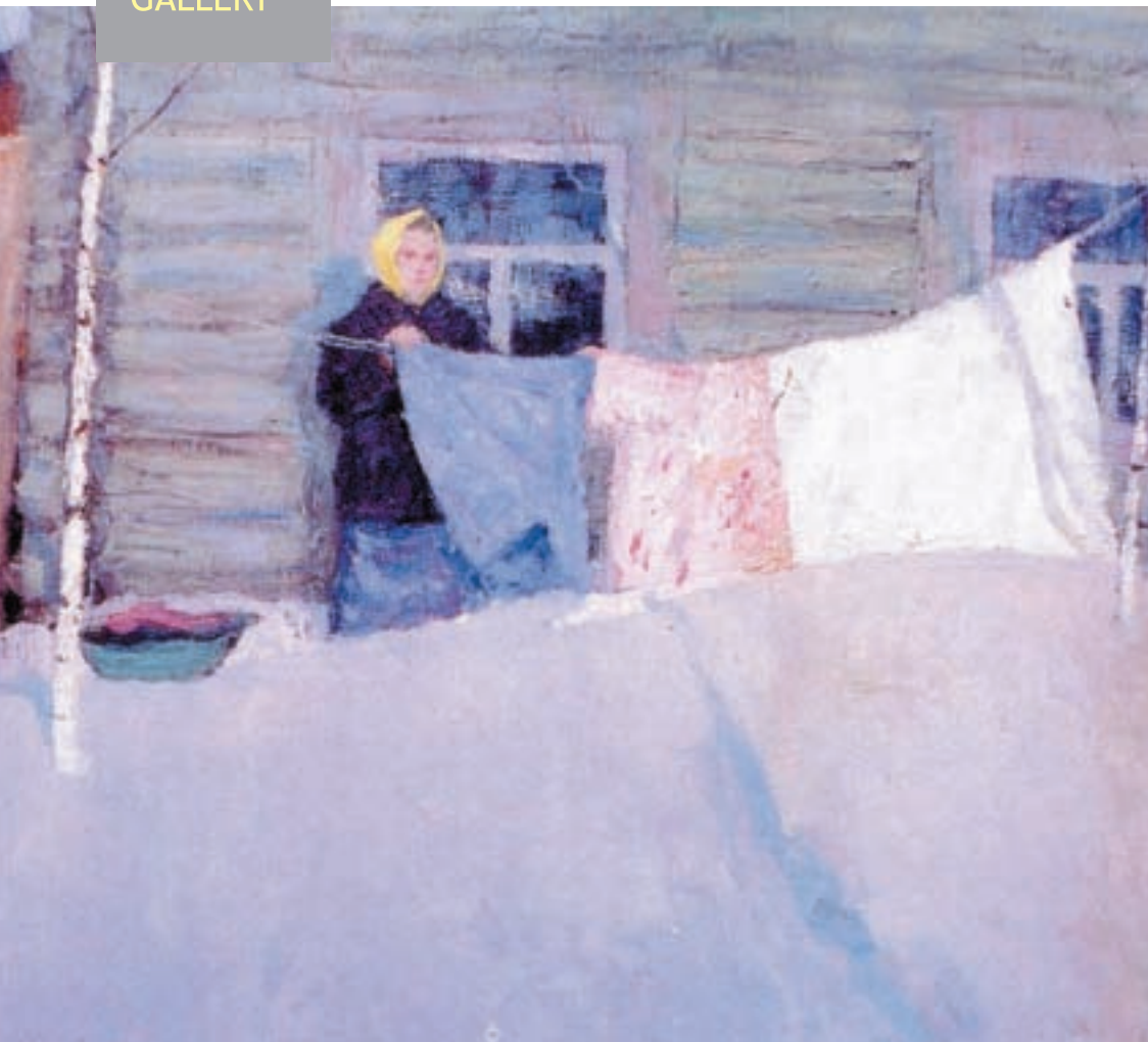
RUMYANTSEV WOMAN WITH WASHING 1962 Oil on canvas 106 x 114cm