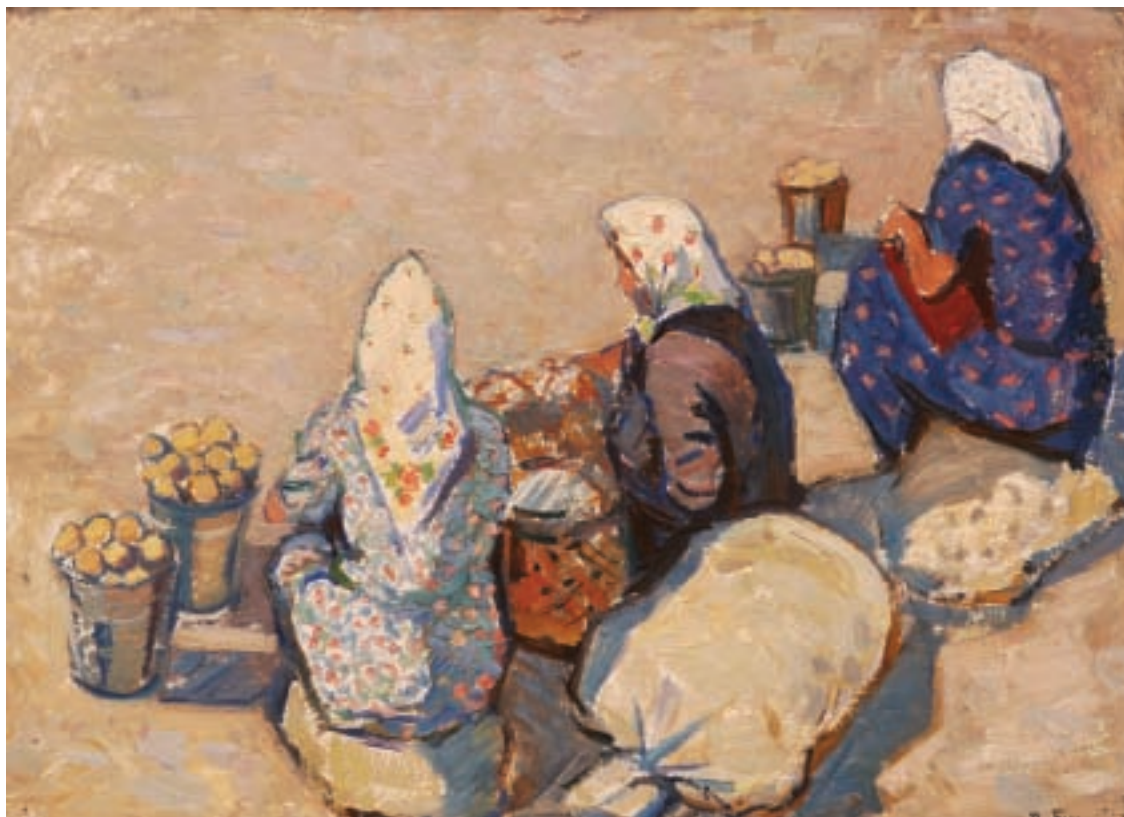
BULINSKAYA AT THE MARKET 1963 Oil on board 50 x 70cm