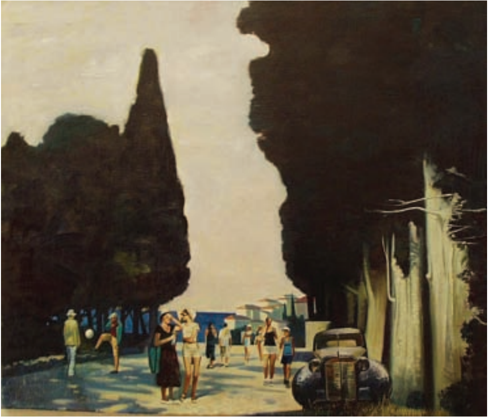
E. KUZNETZOV HOT SUMMER DAY 1998 Oil on canvas 95 x 100cm