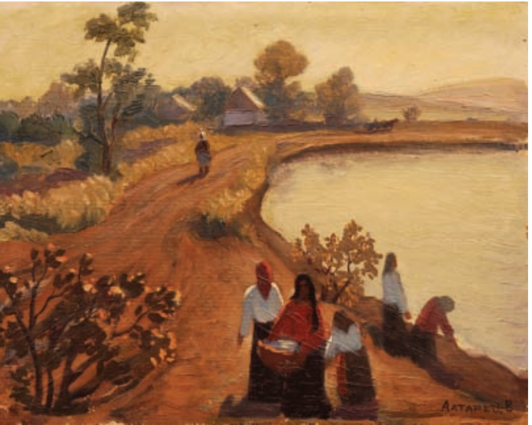
V. ALTANIETZ LAKE 1971 Oil on board 45 x 35cm

their own individual styles. When we compare Altanietz's Lake (1971) (above) and Evening (1982) (opposite) with Mokrozhitsky's Seaborne in the Crimea (1984) (page 12), for instance, we see the extraordinary variety within the Russian art scene. Altanietz's works are reminiscent of a Post-Impressionist style, with the picture plane flattened in the manner of Gauguin or Cezanne and the brush strokes barely visible. Mokrozhitsky's piece, in contrast, shows a far more Impressionistic treatment, with light, lively brush strokes and a subdued colouring far from the bright yellows and red of Altanietz's paintings.