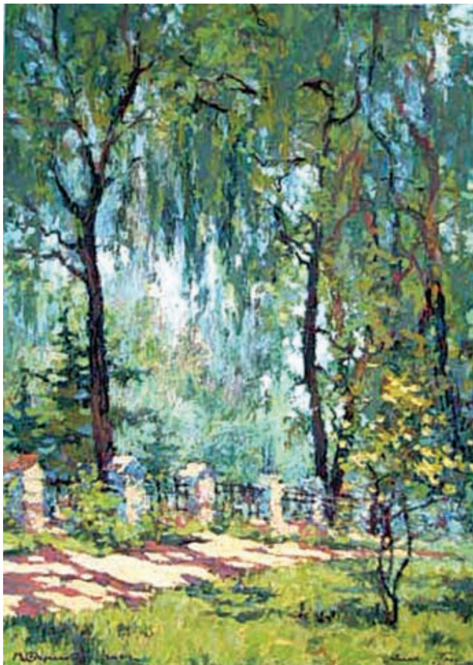
V. BEREGOV ALLEY 2000 Tempura and Pastel on card 44.5 x 60.5cm