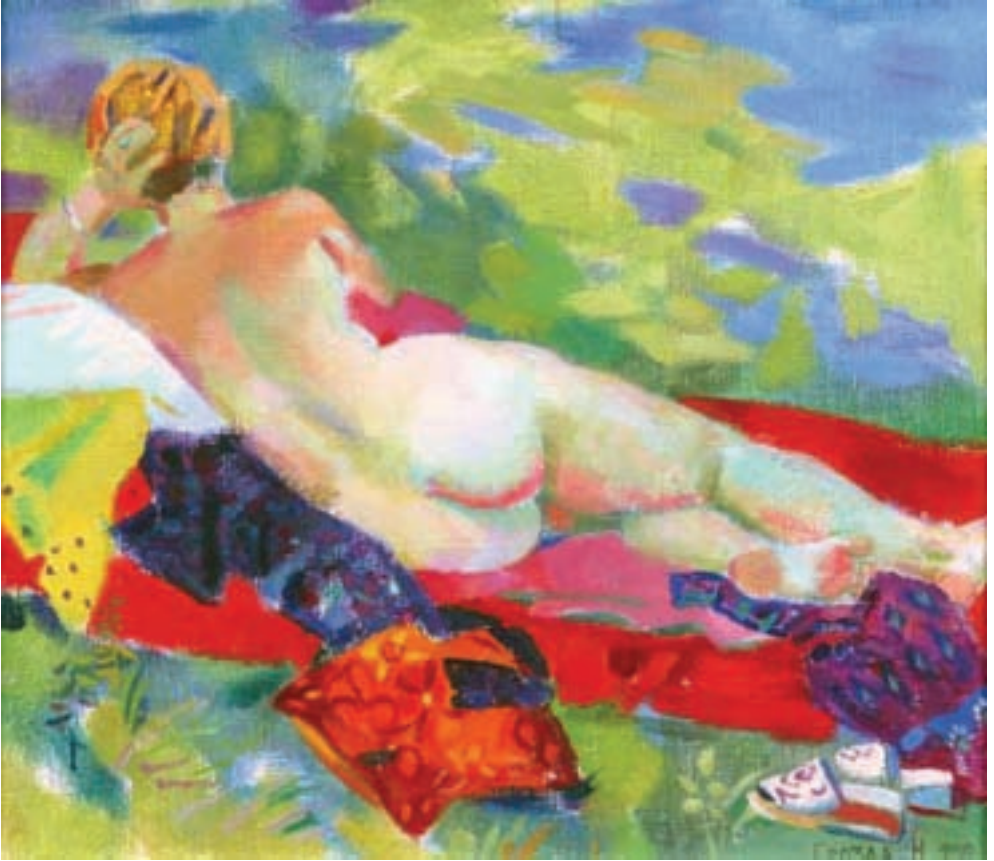
I. GVOZDA NUDE 1999 Oil on canvas 35 x 40cm

Soviet Impressionism. What emerges from this exhibition is not the image of a cohesive style or movement but rather of an art marked by diversity and originality, by the distinctive sensibility of the individual artist. Perhaps the only generalisation we can make concerns the vitality and significance of Russian Impressionism. This is an optimistic art of joyful spirit, offering another view, another insight, into the turbulent life of the Russian people.