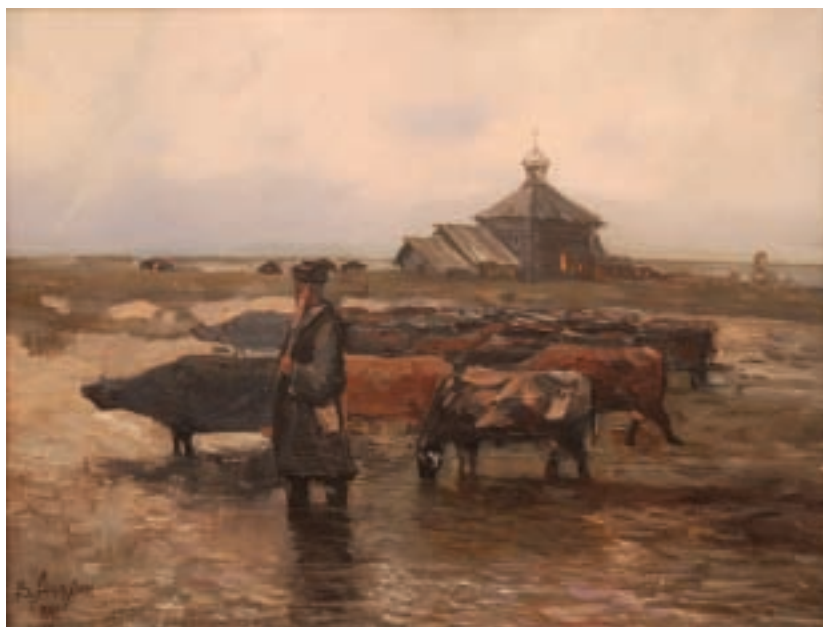
V. ANOKHIN AFTER THE RAIN 1990 Oil on board 33 x 43cm