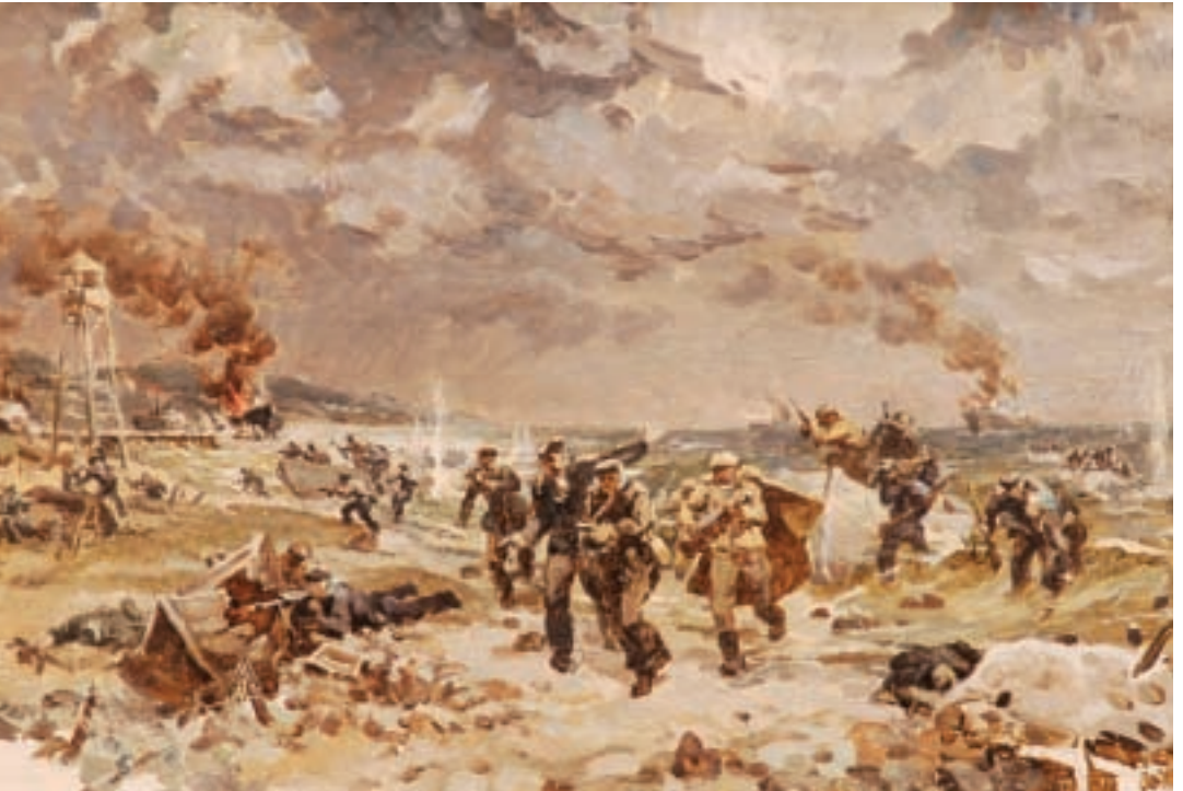
W. MOKROZHITSKY SEABORNE IN THE CRIMEA 1984 Oil on board 30 x 46cm

older generation whilst also stimulating the growth of new artistic talent. The outstanding paintings of Vechkanov – Couple (2000) (page 15), Dedication (2003) (front cover) and Friends II (1999) (page 14), for instance – would have been inconceivable in the Stalinist era. Their unusual style and dramatic compositions lend these paintings an arresting quality. The thick impasto of their surfaces is far from the light touch of earlier Russian Impressionism. Kuznetsov’s Hot Summer’s Day (1998) (page 18) is a further example of the diversity and vitality of the Russian art scene at the turn of this century. Once again, the painting is neither typically Impressionist nor Socialist Realist. What we see is the emergence of the artist’s own personal temperament and distinctive style.