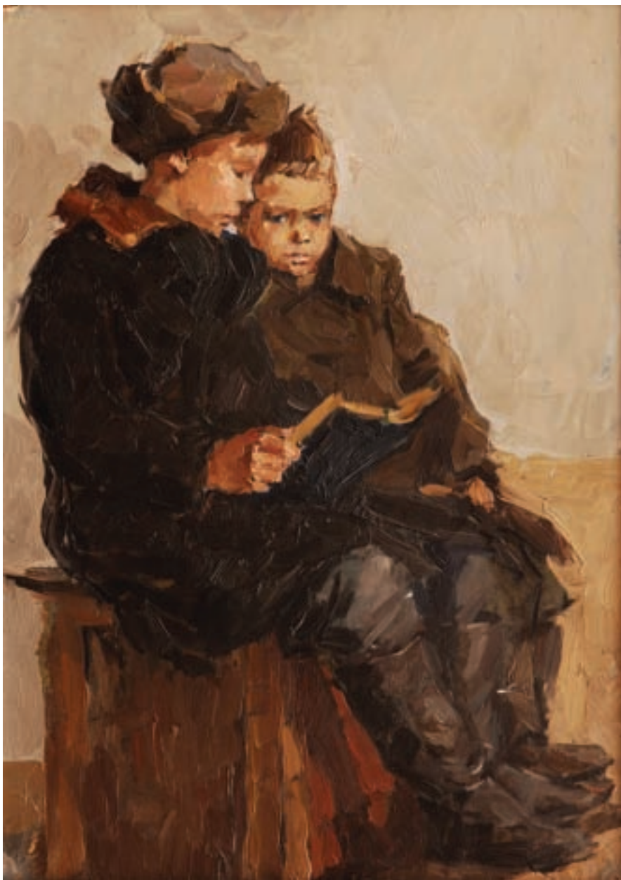
I. POPOV READING TO MY BROTHER 1954 Oil on board 30 x 23cm