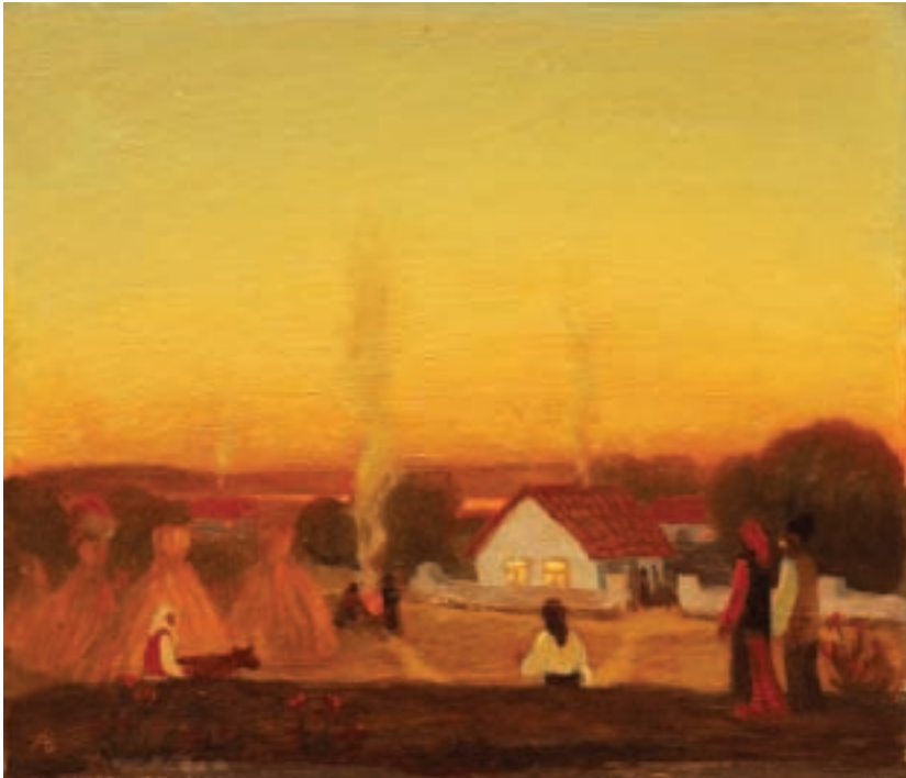
V. ALTANIETZ EVENING 1982 Oil on board 30 x 35cm

French Impressionism was essentially bourgeois; Soviet Impressionism proletarian